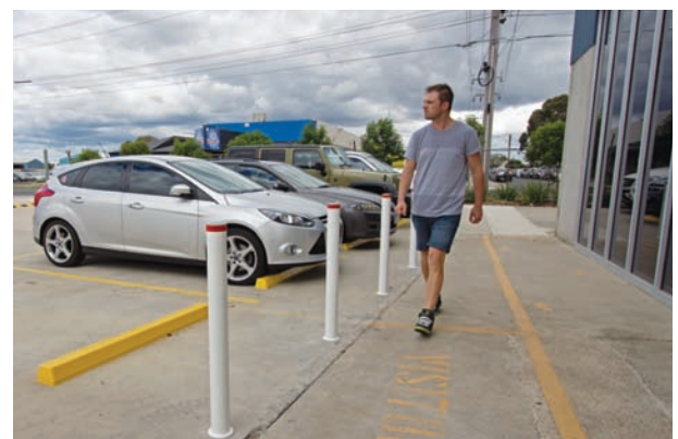
Wheel stops and bollards together provide improved pedestrian safety.