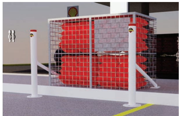
Linebacker BR bollards can be installed onto sloping or stepped ground levels.