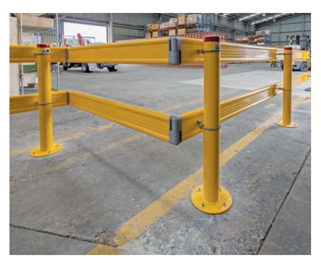
Post mount model shown.