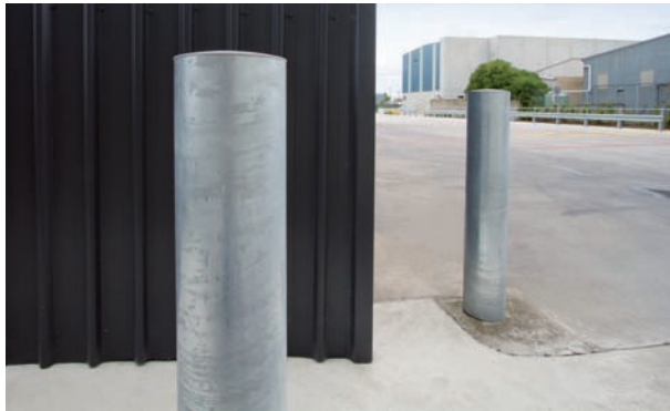
Below ground bollards have fully welded anchoring bars.