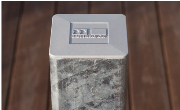
Cast aluminium knock-in caps on all square bollard models.