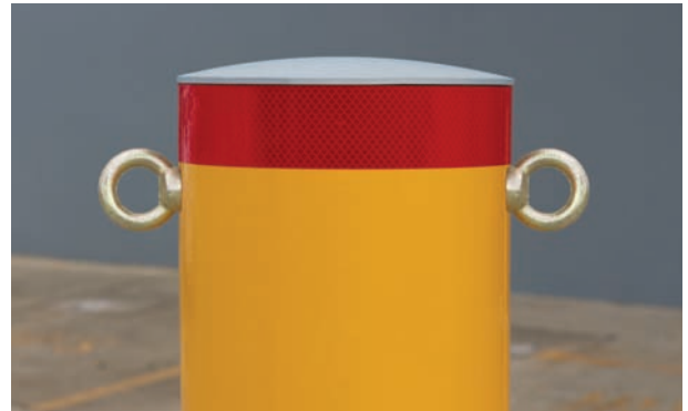
Cast aluminium cap with optional chain ring kit.