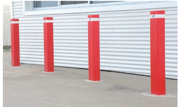
Below ground bollards have fully welded anchoring bars.