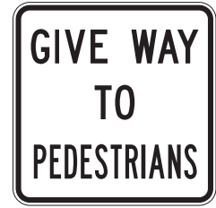
S1155-RA 600 x 600mm