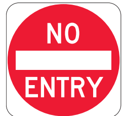
S1018-RA 450 x 450mm