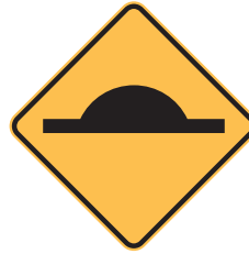
S1000-RA 600 x 600mm