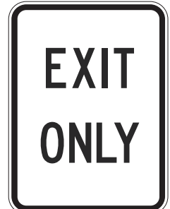
S1167-RA 450 x 600mm