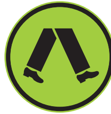
S1007-RA 600mm diameter