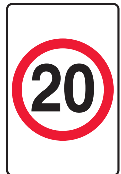
S1170-RA 450 x 600mm