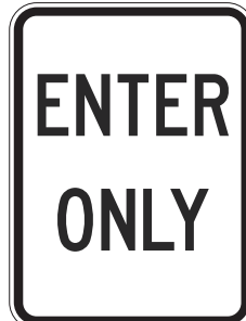
S1166-RA 450 x 600mm