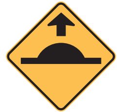
S1001-RA 600 x 600mm