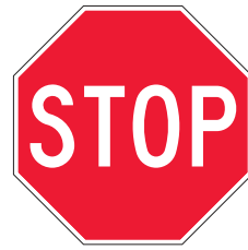
S1005-RA 600 x 600mm