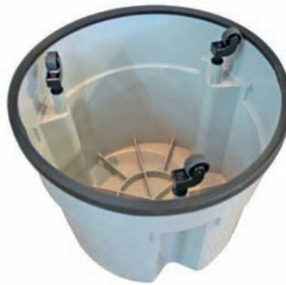
All three models feature spring loaded, retracting caster wheels.