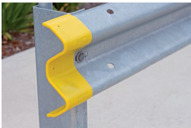
High visibility end boot (included) fits easily onto the W-Beam rail ends.

Installation: Surface mounted with fixings supplied.