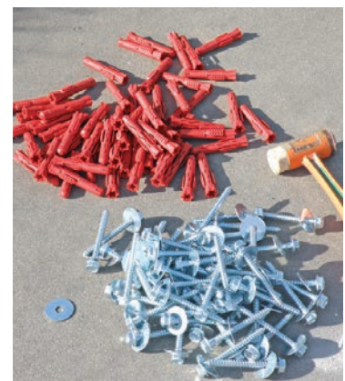
8. Standard fixings supplied