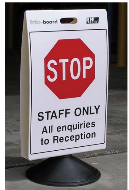
IB7 – 7kg base kit & sign.